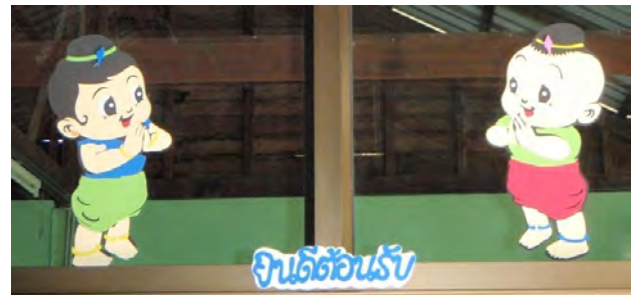
whether we had a few water filters for the little ones