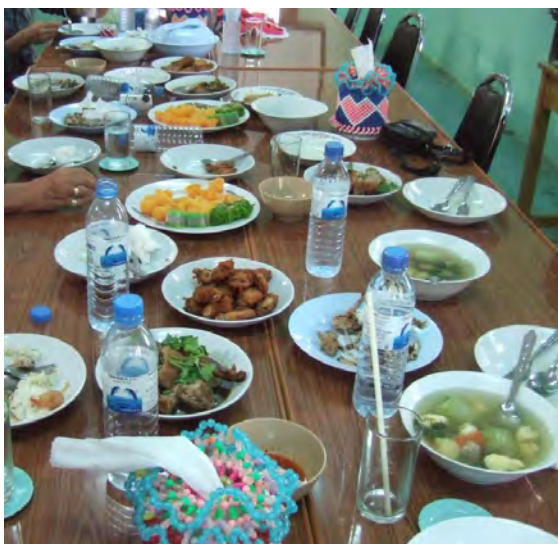
by the school's cooks.