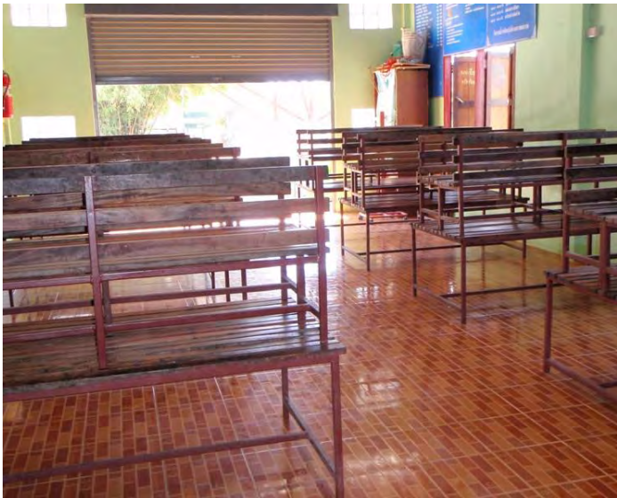
the dining area are sparkling clean!