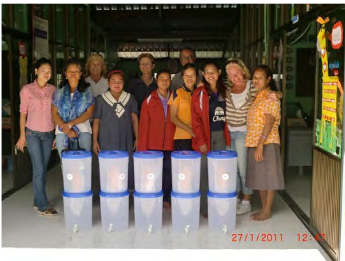
And the kindergarten staff beamed when we gave them five drinking water filters!