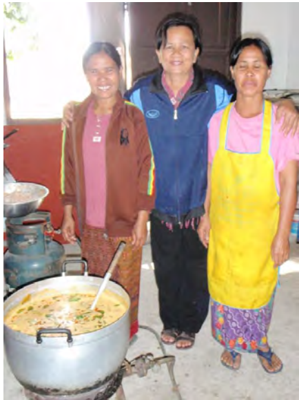
lunch prepared with lots of love

We were then invited for a fantastic lunch