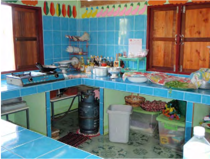
The kitchen and