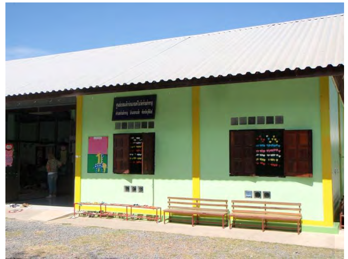
We were asked by the teachers of the nearby kindergarten